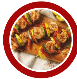
BROCHETA DE CAMARONES