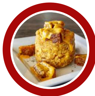
MOFONGO RELLENO CON CHICHARRON DE CERDO